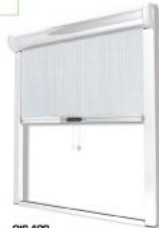
OIS 100 Vertical Insect Screens System