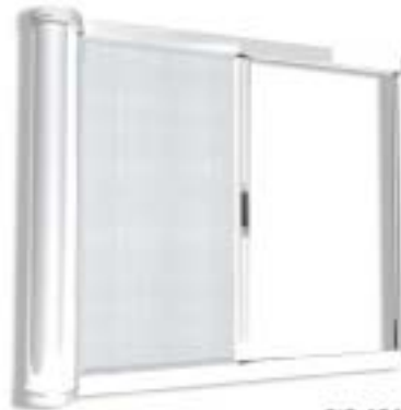
OIS 101 Horizontal Insect Screens System